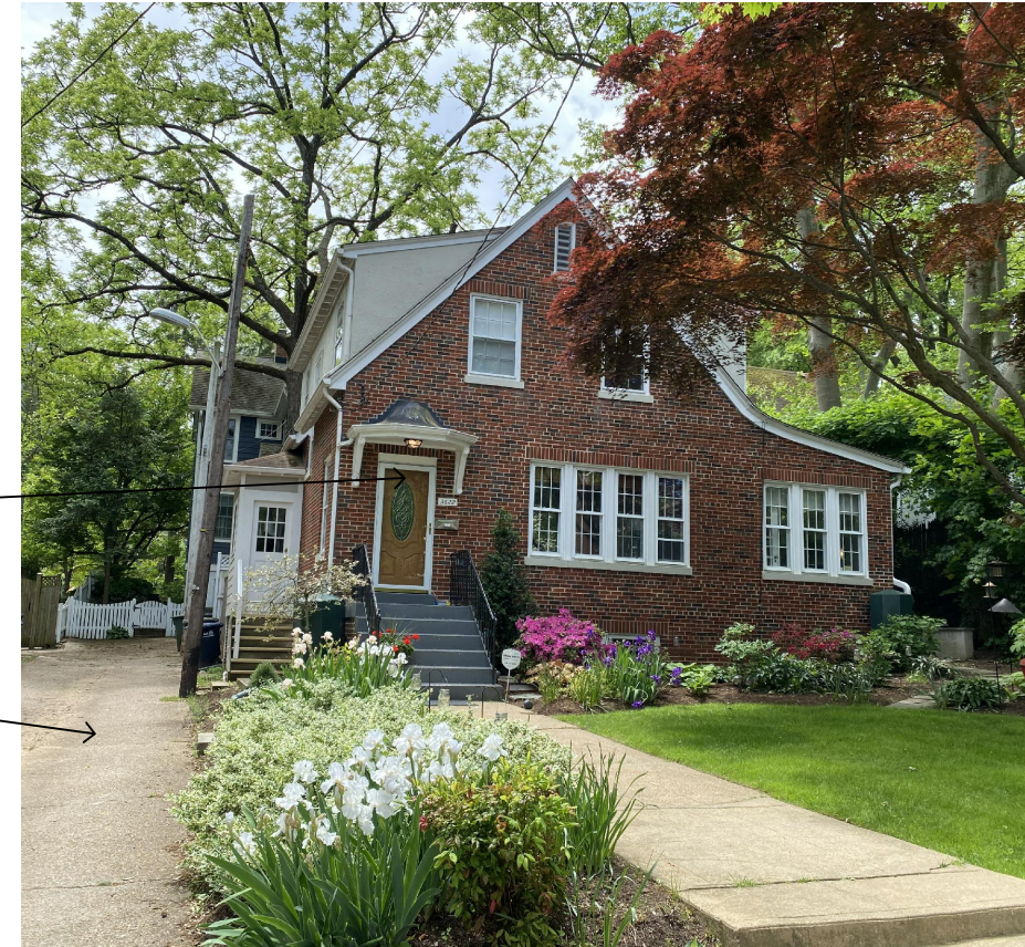
3622 PATTERSON ST NW