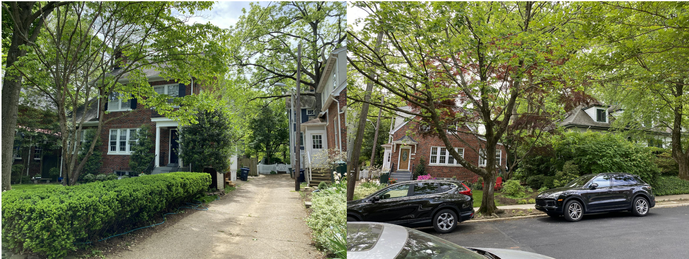
3618 PATTERSON ST NW